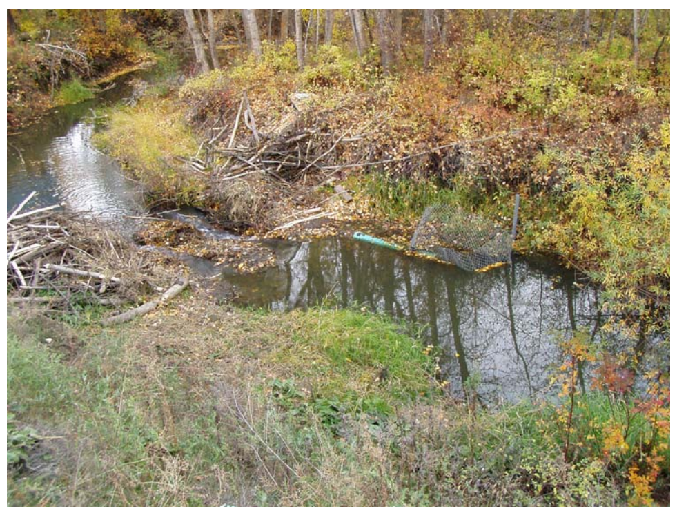
Photo 1. The beaver dam by the "God Sign" was modified to allow additional passage of water. Small channels were also formed on the top of the beaver dam to facilitate fish passage.

a. The construction of beaver dams at the upper end of Middle Vernon Creek was not anticipated. As the beaver dams are located on Duck Lake Indian Reserve No.7, the OFGC has been actively communicating and working with First Nations to address this issue.