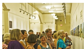
Town celebrates opening of the Yellow Schoolhouse Project