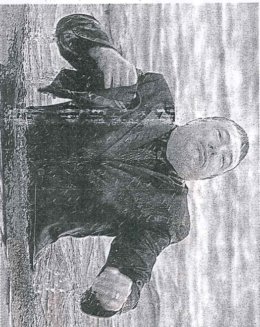
KIRSTIN LESOR/Westside Weekly

Cost was $249,000, provided by the Building Canada Fund, Environment Canada and OBBW.