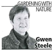
GARDENING WITH NATURE