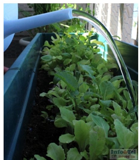
Okanagan Basin Water Board hopes a contest v residents to tighten their taps and conserve water.