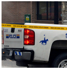
Disturbance involving firearms has been resolved