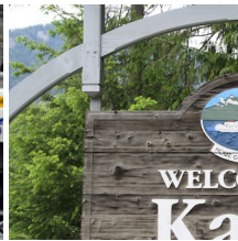
Kaslo addresses light pollution