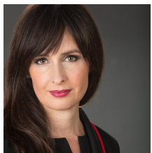
Flu vaccine was useless this year