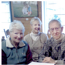
Ratepayers elect new president