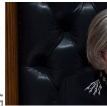
Rural revival vowed in throne speech