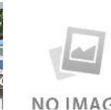
Brain leaves job to focus on mayor's role