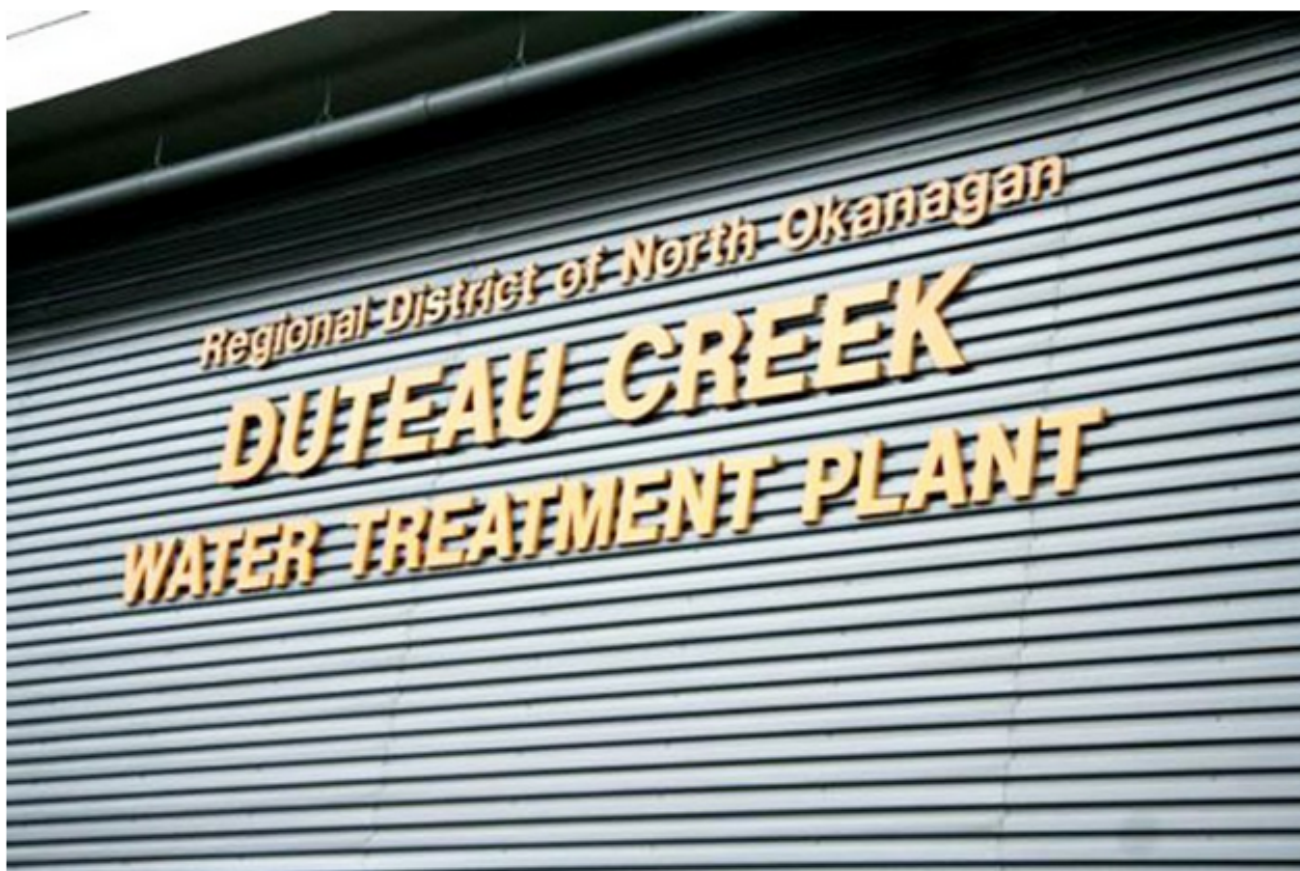
Duteau Creek is currently serving all Greater Vernon water customers.