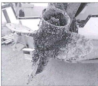
Aberia Environment and Parks