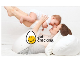
Did you know it's now okay to feed the whole egg to your baby starting at 6 months?