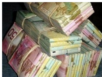
Trade With Jake Pertu In Canada. Invest $250 And Gain Pure Trading Profit Of $10,000 A Day!