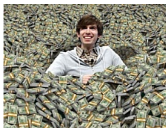
People in Canada Get Wealthy Within A Month With This Offer! WATCH NOW!