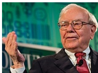
The Quick Solution To Achieving Financial Freedom!