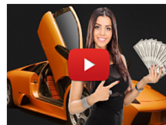
Imagine Thousands of Dollars Pouring Into Your Bank Account! $21,800.89 In 10 Days... Watch Here.