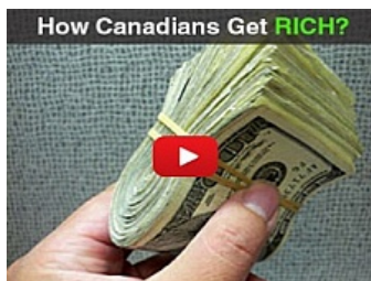
Check How People Get RICH in Canada! It's So Simple! Watch This Video NOW!