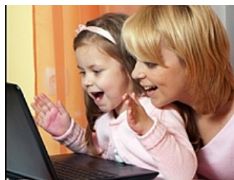
Single Mom Earns $12,000/Month From Her Laptop. Find Out How