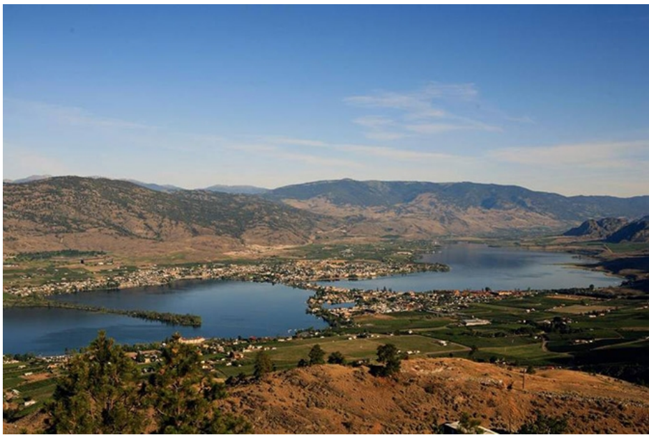
The Osoyoos Lake Water Science Forum, a cross border conference discussing the Okanagan River watershed, took place last week in Osoyoos.