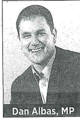
Dan Albas, MP

This terror attack has again renewed calls on the Liberal government to state a clear and coherent position