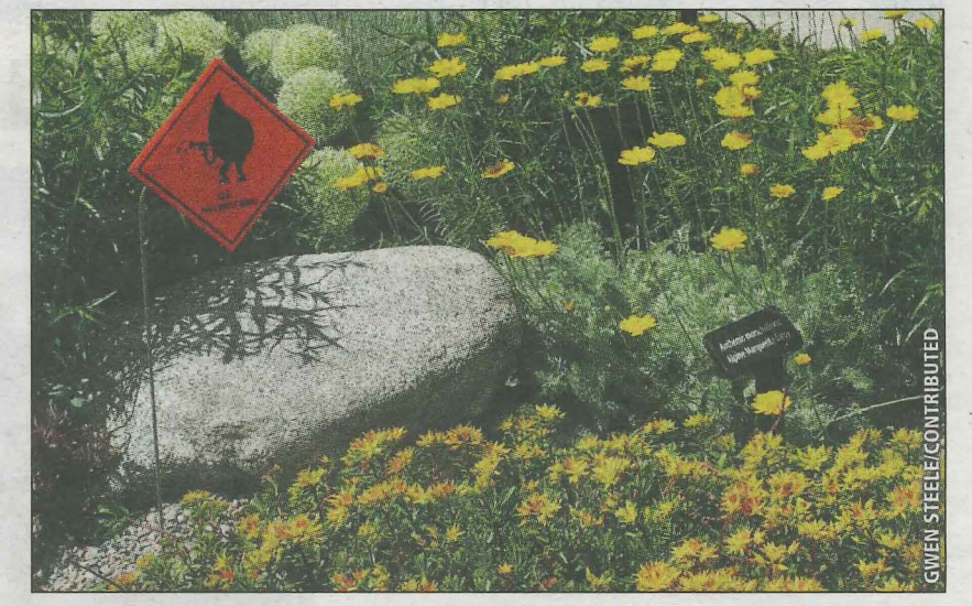
Alpine Marguerite daisy and Russian stonecrop blooming beneath the Make Water Work sign in the unH2O Rock Garden.

Financial support was given by the Okanagan Basin Water Board, the Government of Canada through the Department of the Environment, and the City of Kelowna.