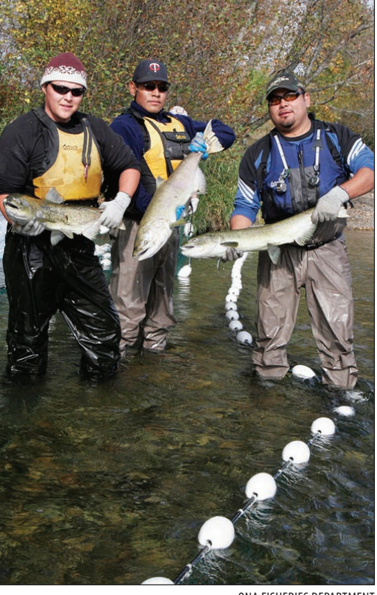
ONA FISHERIES DEPARTMENT

Staff with Okanagan Nation Alliance's fisheries department collect mature salmon from Okanagan River for breeding.