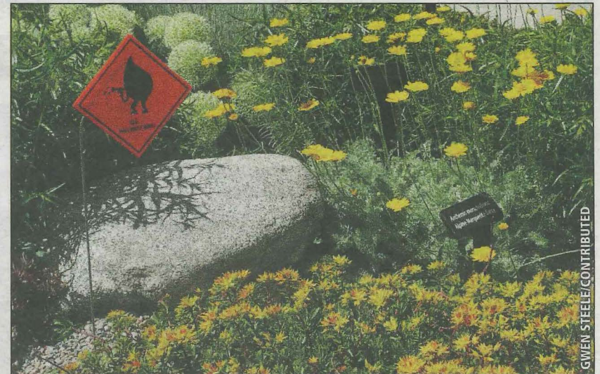
Alpine Marguerite daisy and Russian stonecrop blooming beneath the Make Water Work sign in the unH2O Rock Garden.

Financial support was given by the Okanagan Basin Water Board, the Government of Canada through the Department of the Environment, and the City of Kelowna.