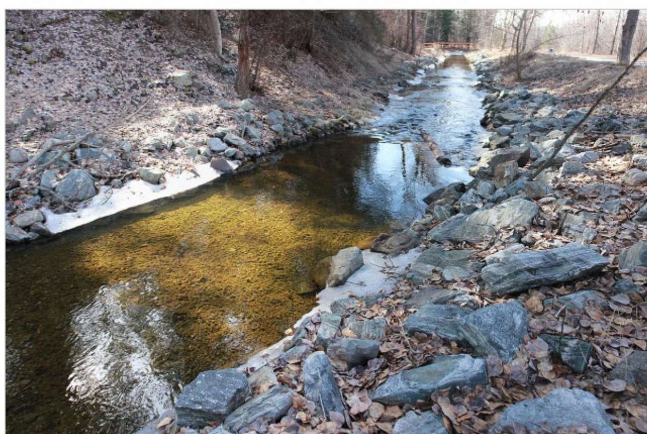
With lower than normal flows into Okanagan Lake from major tributaries such as Mission Creek (above) the lake did not reach "full pool" this spring.