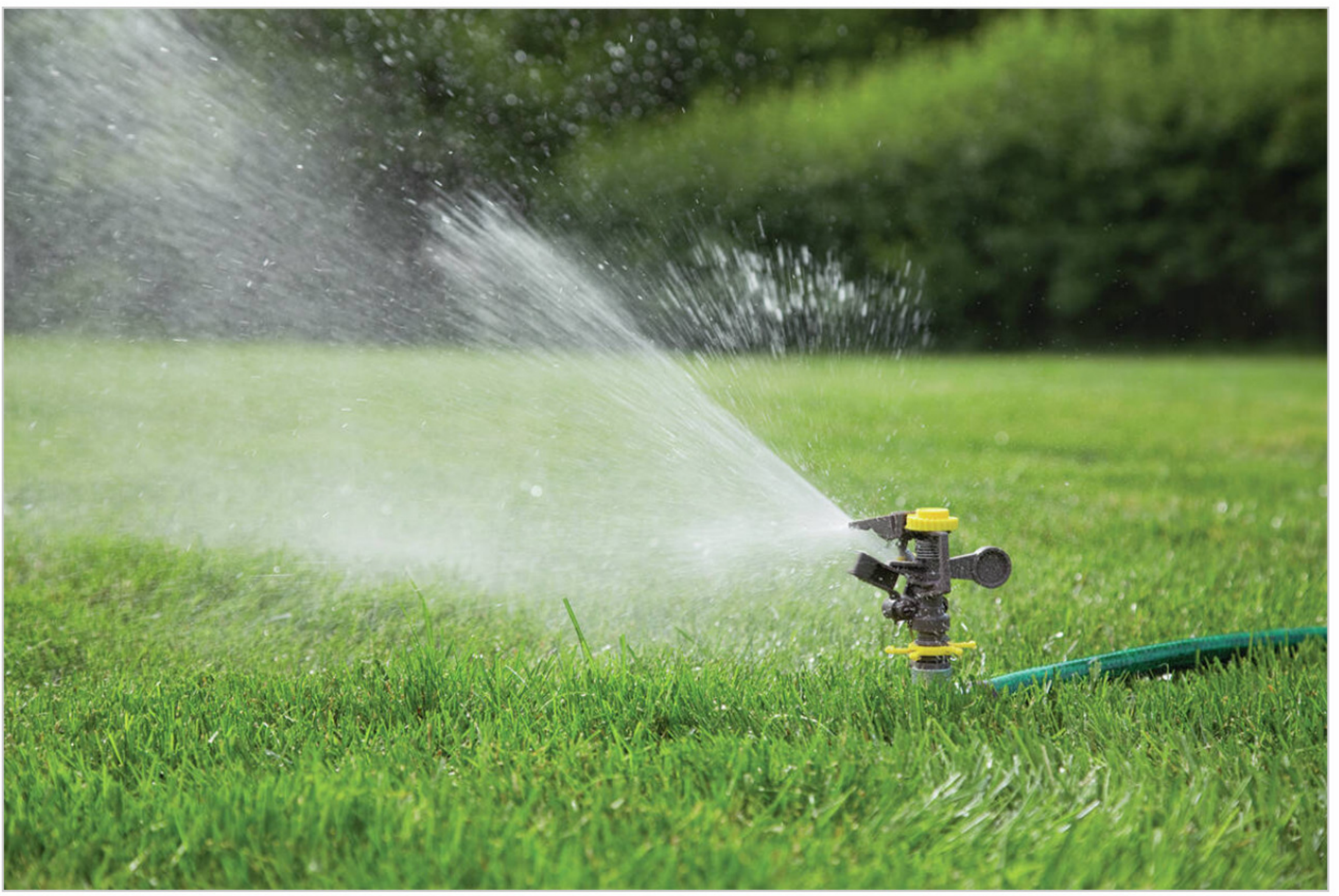
Using a sprinkler to water lawns is out in the City of Armstrong for the time being, as the city moved to Stage 2 water restrictions Friday, May 5. (File photo)