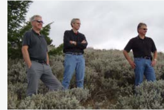
Osoyoos Board members